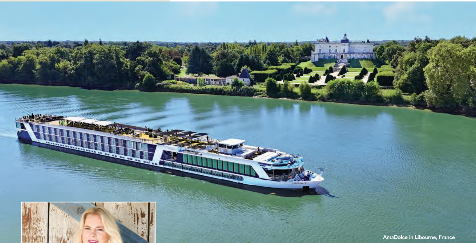
AmaDolce in Libourne, France